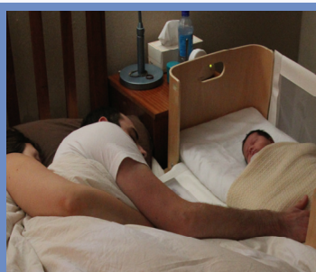
Home 3-sided cot