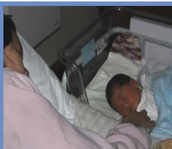
Hospital clip-on cot